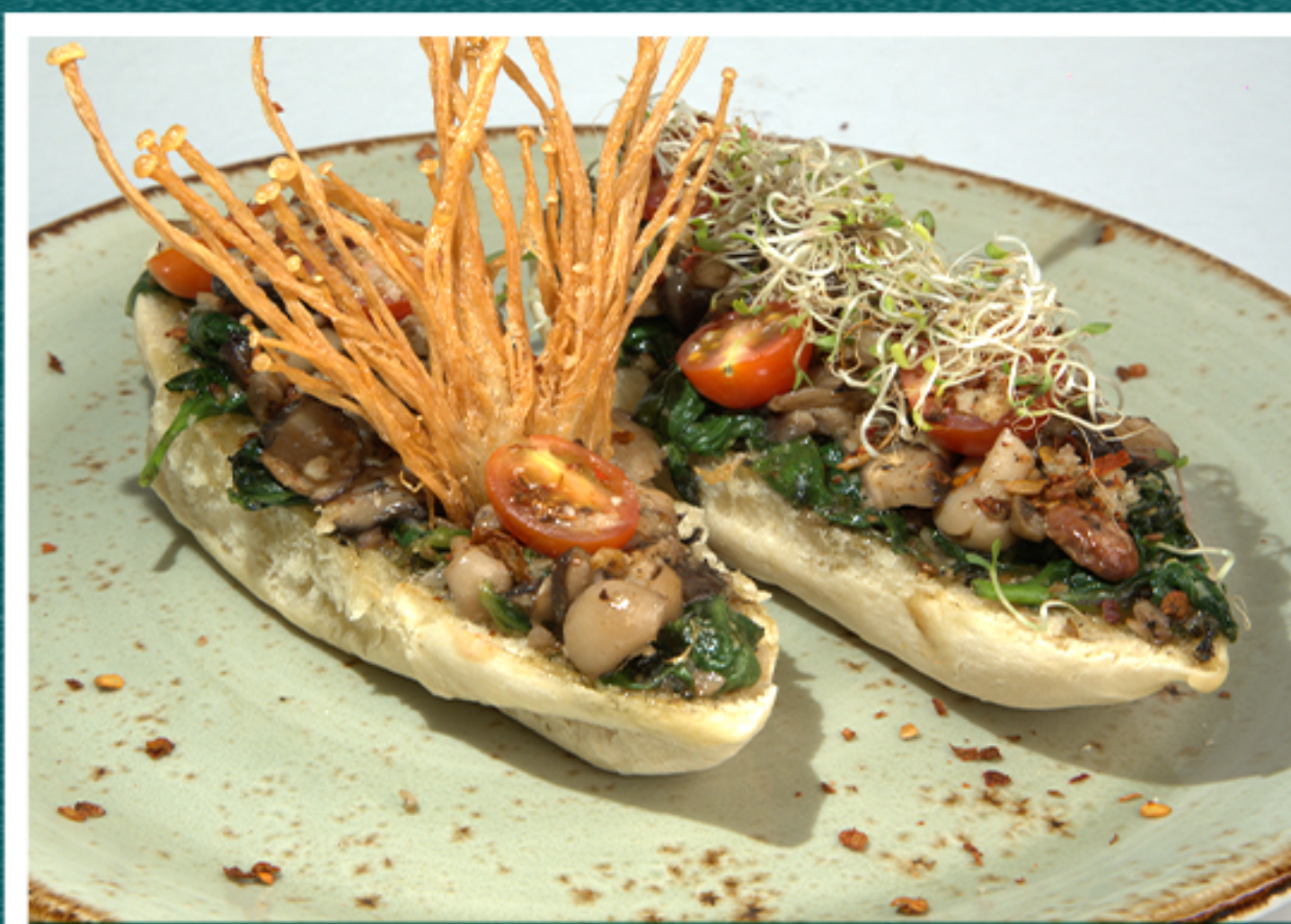
SPINACH AND MUSHROOM TOAST