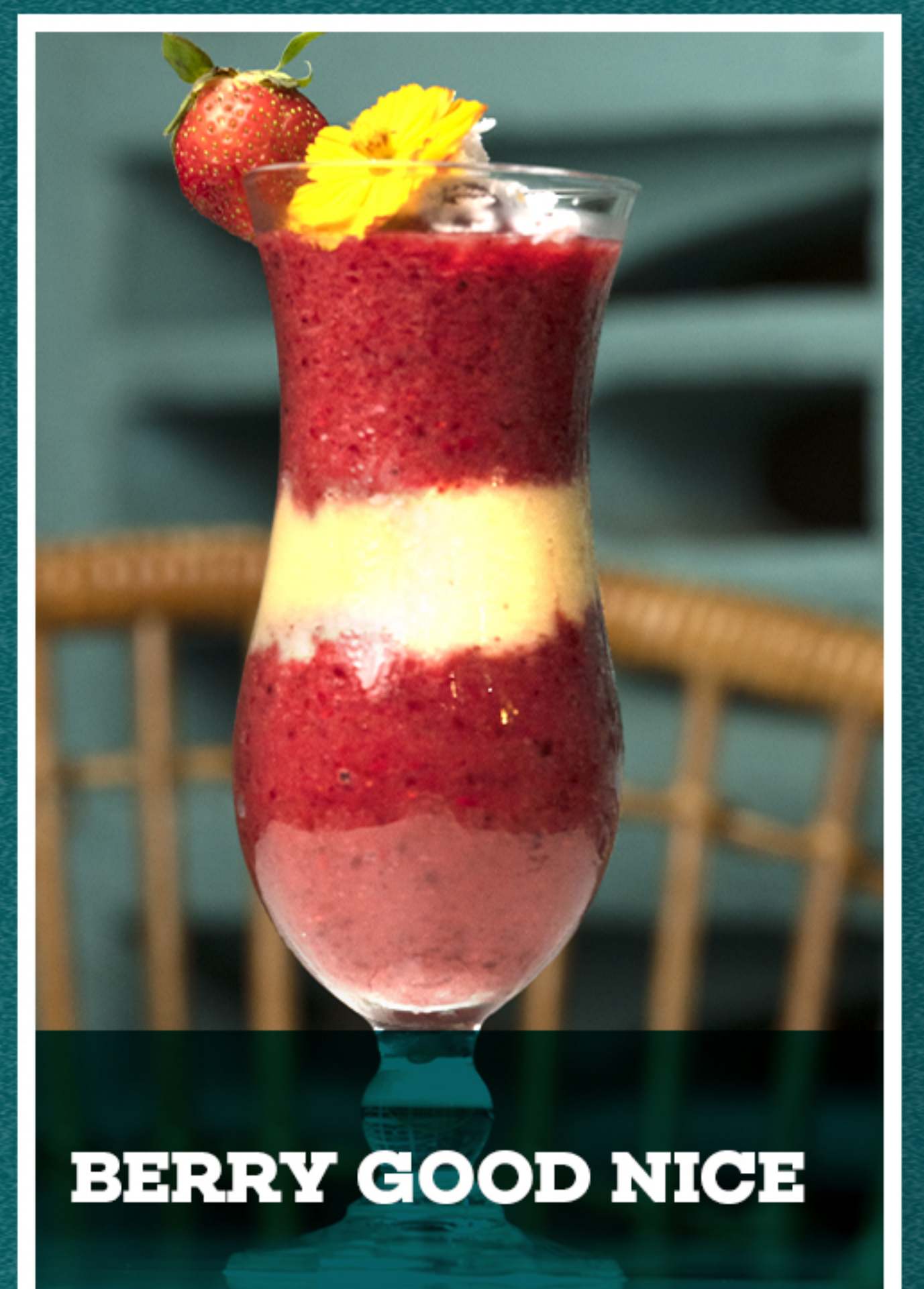
BERRY GOOD NICE