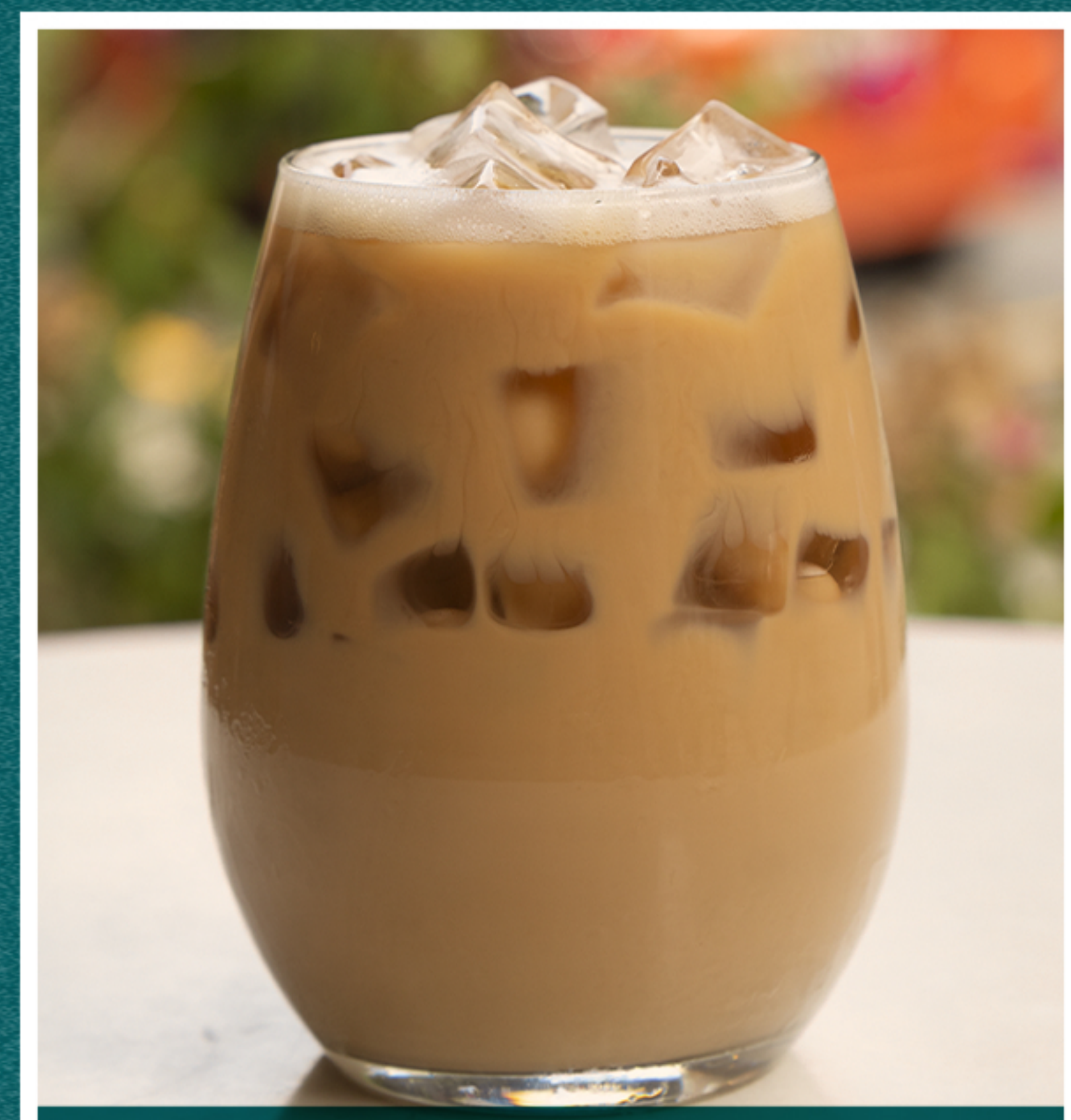
SHAKA ICED LATTE