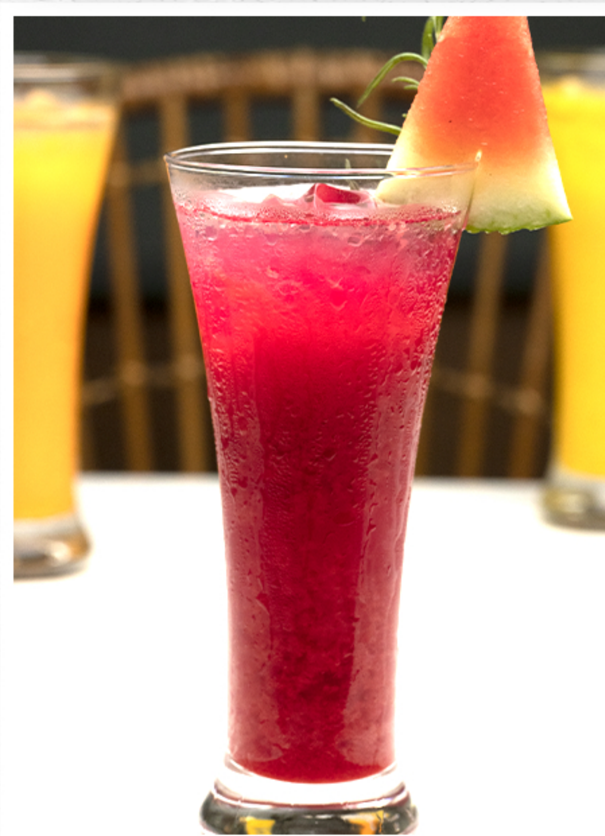
LADY IN RED