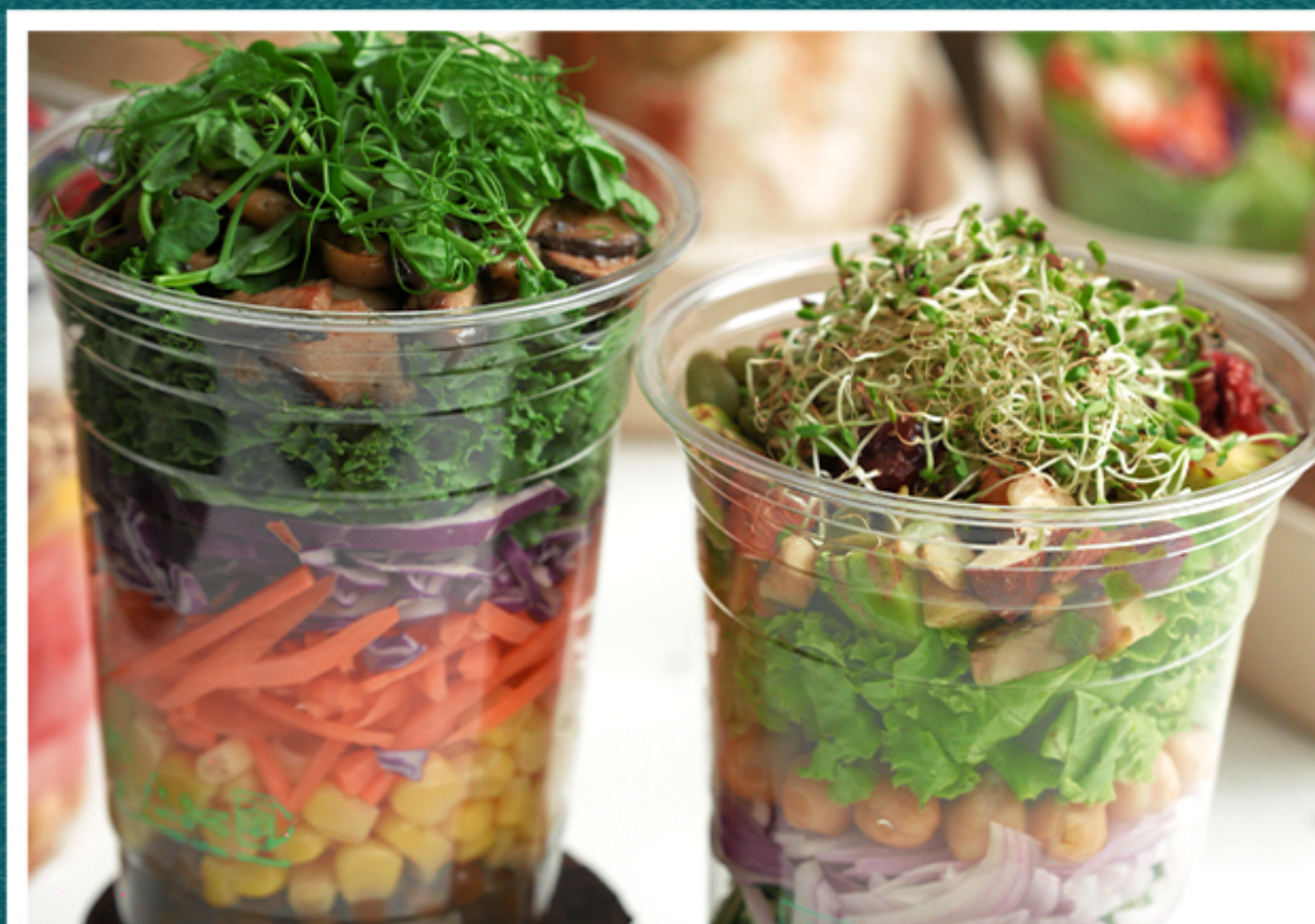
SALAD ON THE GO