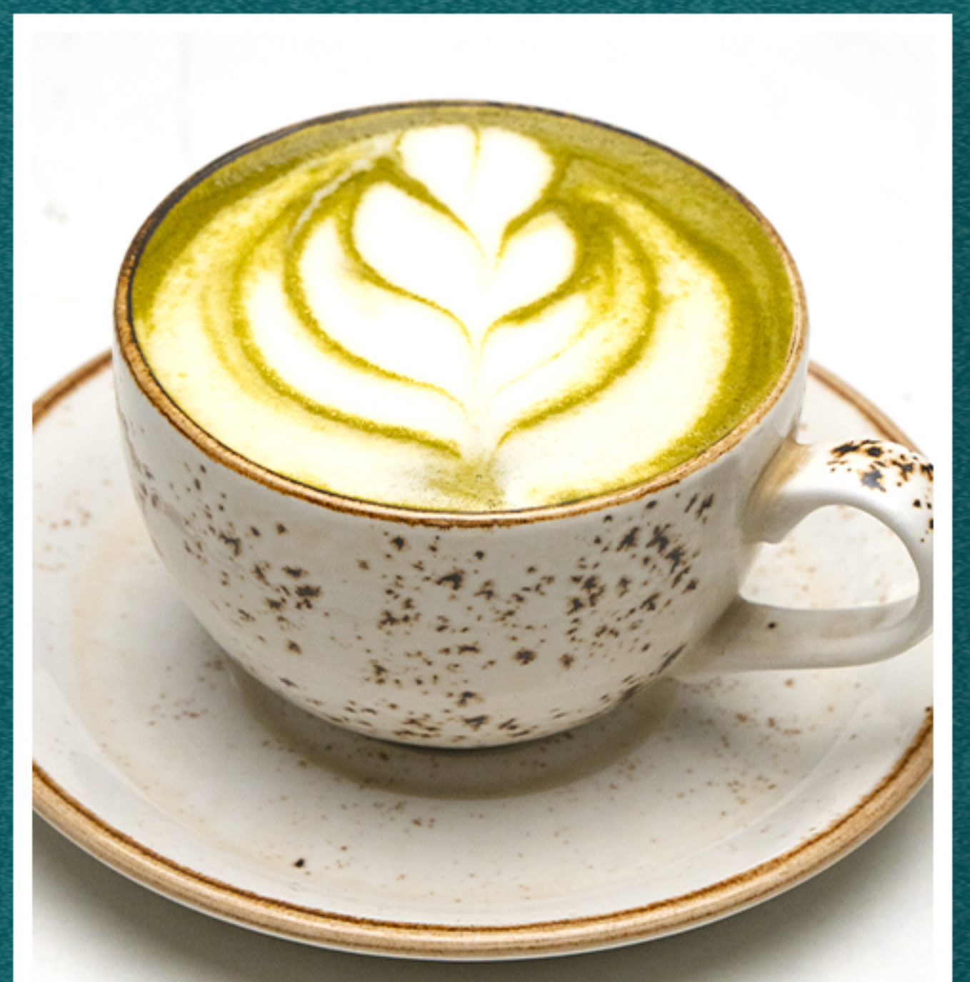
MATCHA LATTE 🍷